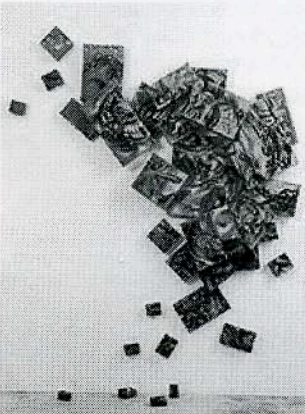
Toy Train Wreck 2003

Though the show includes only four works, each serves not only to disseminate a strange and oddly sexualized narrative that may or may not involve Mickey Mouse and his cohorts. In Untitled/Hands With Hose , for example, five brightly colored, gloved hands (Mickey's trademark, if you remember) are shown grabbing the "spurting" nozzle of a hose. The image is menacingly dazzling, and only serves to ground the viewer in Williams' bizarre dystopia.